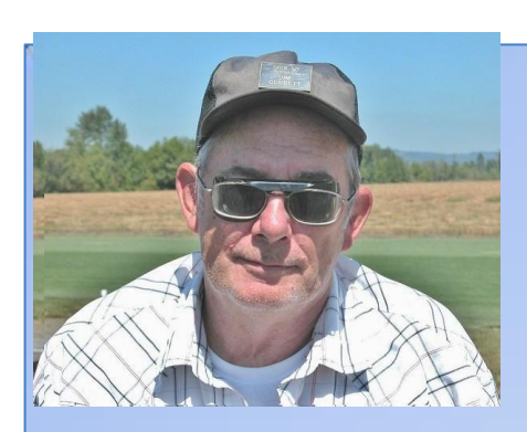
Field notes: Soliciting for more Watering Crew volunteers.

Email me or come to the next meeting and let me know if you are willing to be part of the crew.